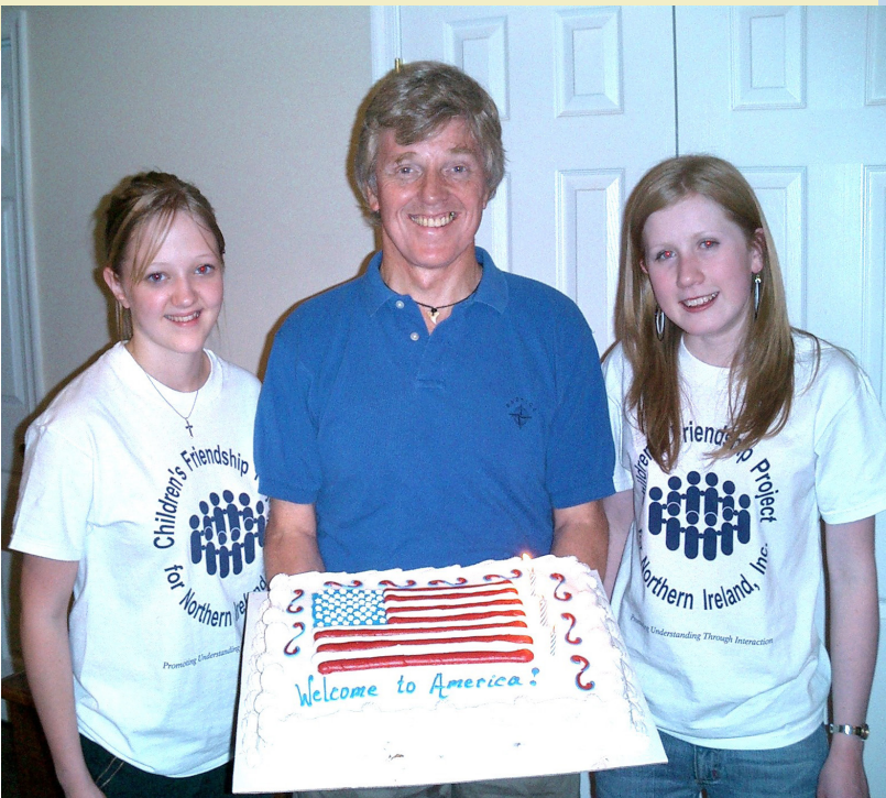
2022 Annual Report

Creating Friendships for Peace would not exist if there had not been a Children's Friendship Project for Northern Ireland (CFPNI). When it was decided to cease CFPNI US operations, many of the US volunteers who made CFPNI successful wished to continue providing opportunities for teenagers in conflict communities to get to know each other in the safety and neutrality of an American home. These volunteers reorganized, first under the name of Cyprus Friendship Program, and then again later under the name of Creating Friendships for Peace, once teenagers were being brought to the United States from more than one conflict area.