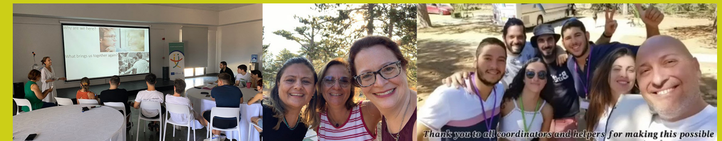
Thank you to all coordinators and helpers for making this possible

We owe a tremendous debt of gratitude to our volunteers for their commitment to our vision, philosophy and theory of change. Leveraging unlikely friendships between teens from opposite sides of their conflict requires sustained dedication by many CFP volunteers and makes all our programs possible, building the bridge to a more peaceful world.