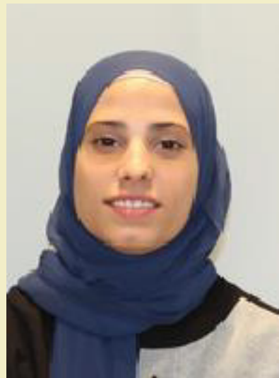
2023 Annual Report