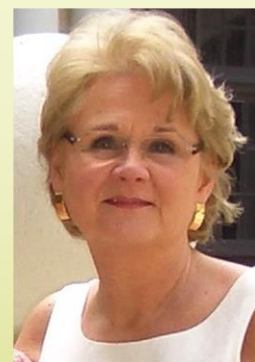
Linda K. Ziglar Chair

There is still hope. Thank you all for making this possible through your hosting, prayers, words of encouragement, and financial support.